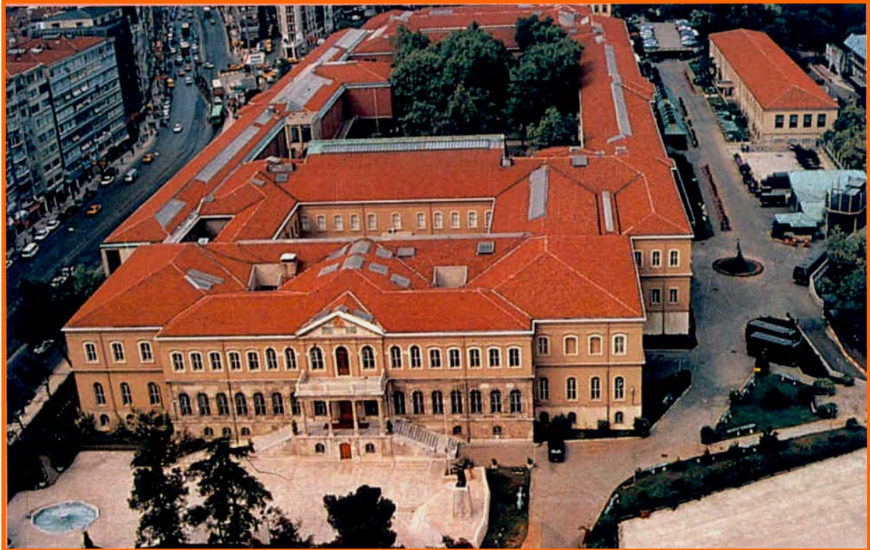
Overview of Military Museum and Culture Center , Harbiye / Istanbul