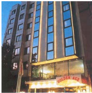
Golden Age 2