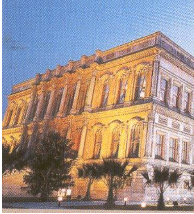
Çırağan Palace Hotel Kempinski