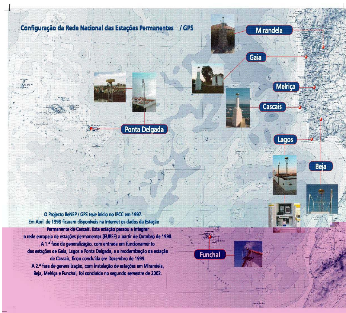
Figure 3 – GPS Permanent Network

All the data regarding these 8 stations can be obtained at the anonymous ftp of IGP: ftp://ftp.igeo.pt/pub/gpsdata/ .